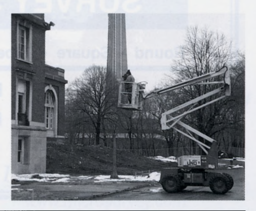
The Ontario Land Surveyor, Winter 2002/03

The building is approximately 20 metres high and would require two lines of stereo photography to ensure complete coverage. To meet the 5mm accuracy requirement, a photo scale of 1:200 was chosen for the first line of